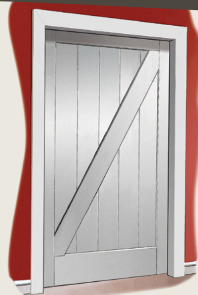
STILEChoice® Barn Door Specification as viewed from the opposite side.

than your finished opening. Using the Barn Door Specification, the door — when viewed from the opposite side, in the closed position — the stiles and rails will look normal and proportional, rather than too narrow.